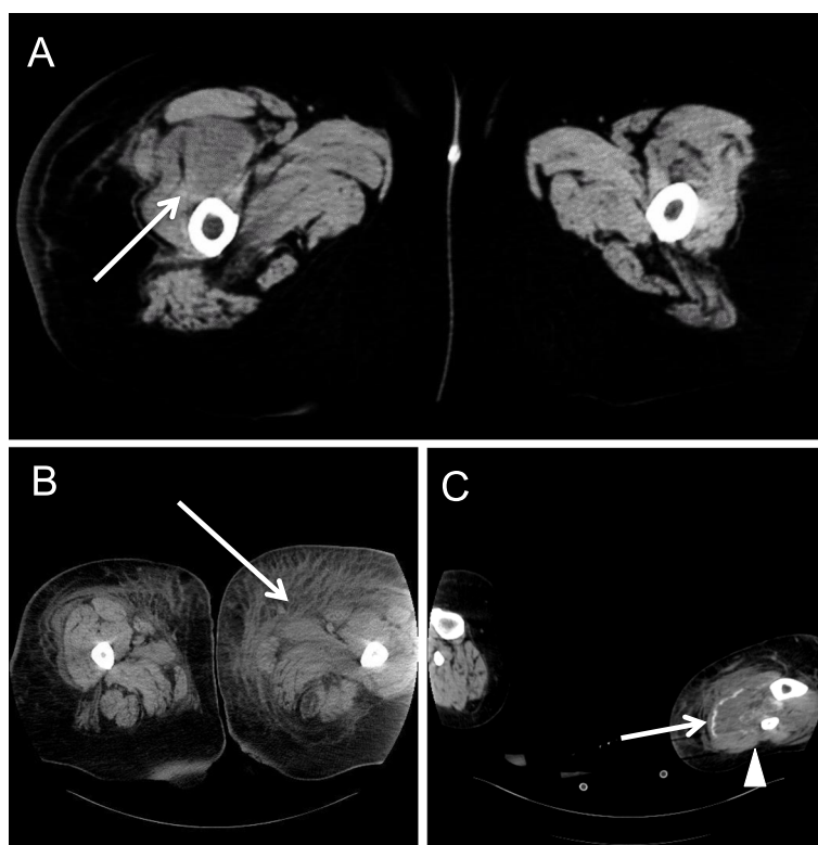
Fig. 1 Plain computed tomography (CT) images of muscle damages. a CT in case 1 shows swelling and low-density areas in the right quadriceps femoris muscle (arrow). b, c CT in case 2 shows swelling and low-density areas in the left adductor muscles (arrow) ( b ) and in the left gastrocnemius muscle (arrowhead) ( c ) and swelling and low-/high-density areas in the soleus muscle (arrow) ( c )